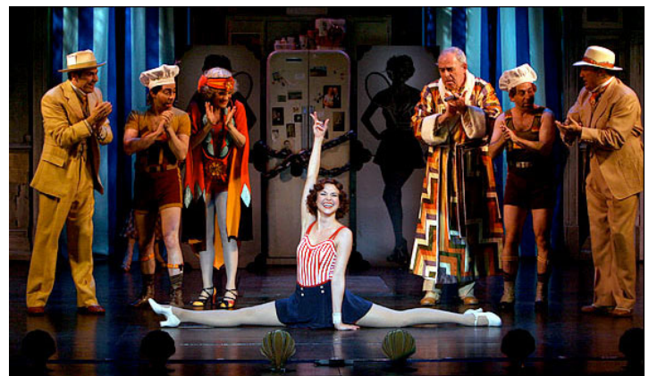
Sutton Foster as Janet Van de Graaf in the original Broadway production.