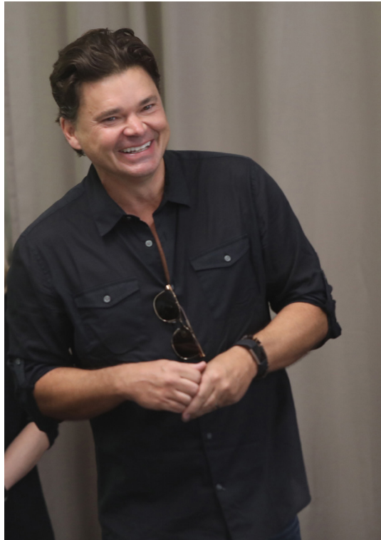
Director Hunter Foster at the first rehearsal for The Drowsy Chaperone.

Before BroadwayWorld.com and YouTube, if you were a fan